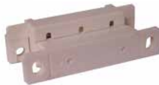
Magnetic Reed Door Switch