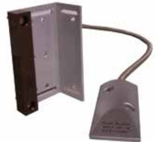
Heavy Duty Magnetic Reed Door Switch