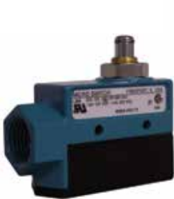
Plunger Style Door Switch