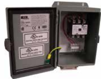
Motor Control Panel