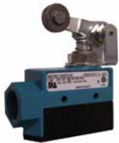
Roller Style Door Switch